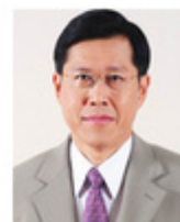
Hon'ble Mr. Phongthep Thepkanjana Former Deputy Prime Minister and Chief Judge, Thailand