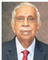
Hon'ble Mr. Justice M.N. Venkatachaliah Former Chief Justice of India