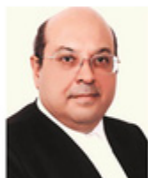
Hon'ble Mr. Justice R.F. Nariman Judge, Supreme Court of India