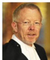
Prof. Hon. Clyde Croft AM SC Former Judge, Supreme Court of Victoria, Australia