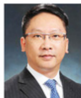
Mr. Rimsy Yuen Kwok-keung Former Secretary for Justice of Hong Kong SAR