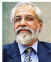
Hon'ble Mr. Justice Madan B. Lokur Former Judge Supreme Court of India